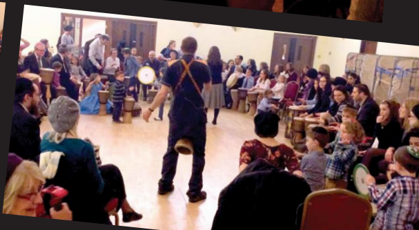
Havdalah extravaganza in Edinburgh (left) and in Glasgow (below)