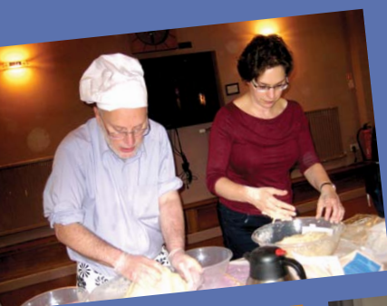
Challah-baking in Edinburgh (below) and in Glasgow (foot)