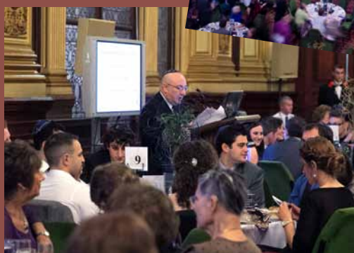
THE MAGNIFICENT SETTING OF THE CITY CHAMBERS* WITH (ANTICLOCKWISE) CHAPLAIN WITH CURRENT STUDENTS; 15 PAST PRESIDENTS FROM 1948 TO 2012; CHARLES KENNEDY WITH PRINCIPAL ANTON MUSCATELLI; HARVEY KAPLAN PRESENTING A HISTORY OF THE SOCIETY*.