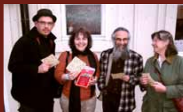
AT THE TIP O' THE TONGUE FESTIVAL OF ORAL CULTURE ON JURA.

GLASGOW YIFAT 0141 - 577 8200 EDINBURGH JACKIE 07734 - 291 836 DUNDEE SHARON 0141 - 638 6411 ABERDEEN EHUD 01224 - 485 601 ARGYLL & HIGHLANDS FRANK 01445 - 712 151 STUDENTS GARRY & SUZANNE 0141 - 638 9403 07791 - 292 790