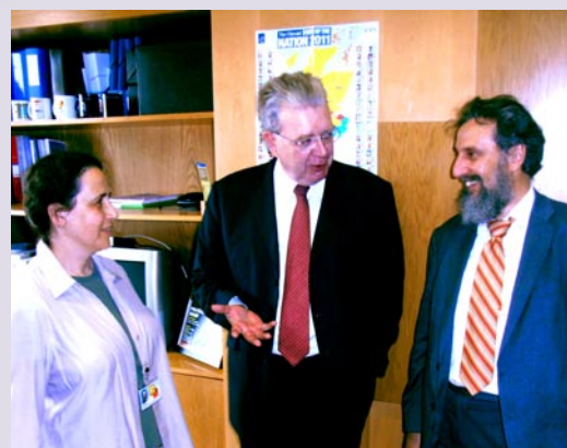
TOP LEFT: WITH ROSEANNA CUNNINGHAM, MINISTER FOR COMMUNITY SAFETY AND LEGAL AFFAIRS; AND ABOVE: WITH MIKE RUSSELL, CABINET SECRETARY FOR EDUCATION AND LIFELONG LEARNING