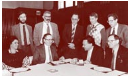
THE SCOTTISH JEWISH STANDING COMMITTEE, 1988