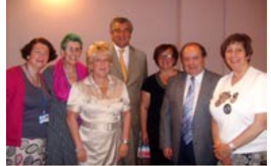
SPEAKERS & ORGANISERS AT THE AJR ANNUAL MEETING IN EDINBURGH

NB No over-large armchair was used in the writing of this monologue.