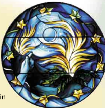
ABOVE RIGHT, ROSH CHODESH WINDOW

Visitors ranged from school teachers and local religious lay leaders to local residents and members of the general public - and we even had a university class working on a project that including filming certain aspects of the Synagogue.