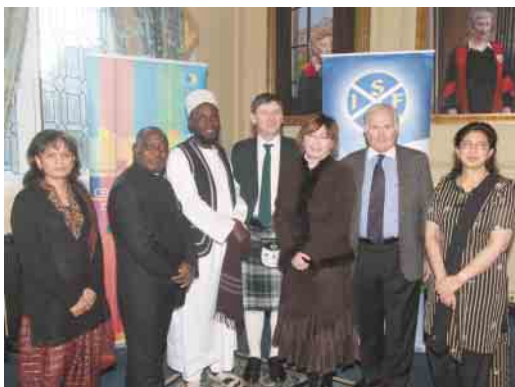
BELOW LEFT: THE CLOSING EVENT IN ST ANDREWS

The culmination of the week was an event at St Andrews University which began with a performance of popular songs played by Fife Constabulary Pipe Band. The theme of this event was 'valuing each other', and this was emphasised by the joint presentations given during the day. One very interesting and thoughtful contribution was from two Glasgow University students who talked about their participation in the recent Interfaith Pilgrimage to Israel and Palestine – an example of one of the many excellent projects being undertaken to break down the barriers and bridge the gaps between different faiths.