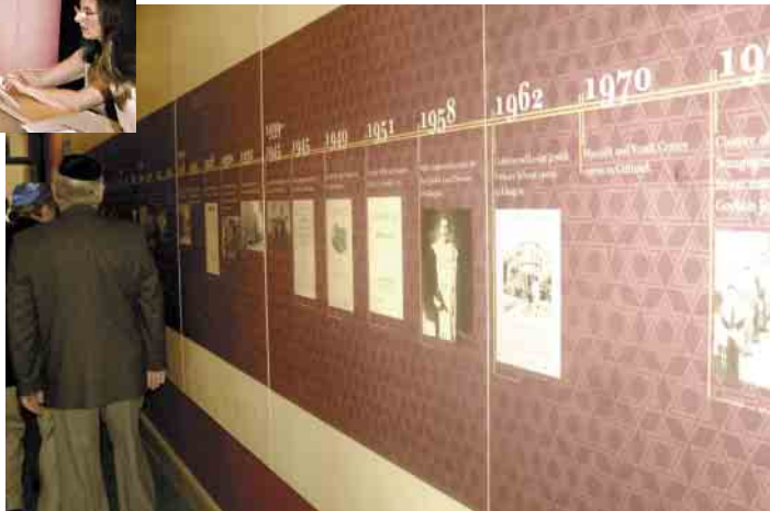
RIGHT: THE TIMELINE OF JEWISH HISTORY IN SCOTLAND IN THE ENTRANCE TO THE ARCHIVES CENTRE