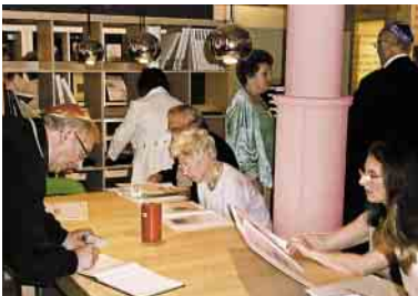
ABOVE: VISITORS IN THE NEWLY REFURBISHED JACOBS ROOM

The exhibition was formally opened in June by Communities Minister Stewart Maxwell, who described it as an “interesting and important resource that illustrates the active input of Jews into Scottish life, the contributions and sacrifices they have made, and their achievements in fields such as medicine, dentistry, law, politics, education, and welfare.”