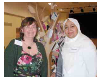
ABOVE: PARTICIPANTS AT THE LAUNCH OF INTER-FAITH WEEK IN EAST RENFREWSHIRE IN FRONT OF THE INTER-FAITH MESSAGES TREE

In pride of place stood a beautiful carved tree on which were hung books created by different women's groups and school students across Scotland, as part of an arts project called 'The Work of Many Hands'. Participants discussed shared values and then created books of words from faith traditions decorated with recycled paper and material.