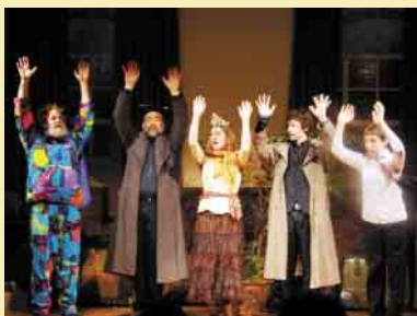
BELOW: FINALE OF 2008 PURIM SPIEL AT ELJC SUKKAT SHALOM

It turns out that the evil Haman (booo!) is really the evil Davros, building secret Daleks to "ex-termin-ate" the Jews. Haman/Davros was having great problems getting the Daleks to articulate their genocidal intent; but they did manage to command "ex-fo-li-ate!" to our generously bearded Haman and Ahashverus. But all is well: Dr Who adopts the name Mordechai, and Rose calls herself Esther. Esther wins the confidence of Ahashverus, and ... well, you know the rest.