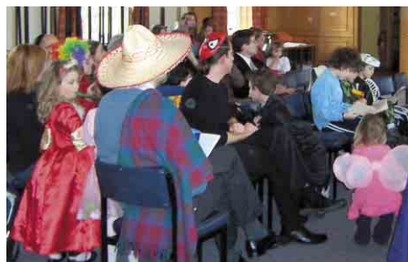
ABERDEEN SYNAGOGUE MEMBERS BEFORE THE MEGILLAH READING