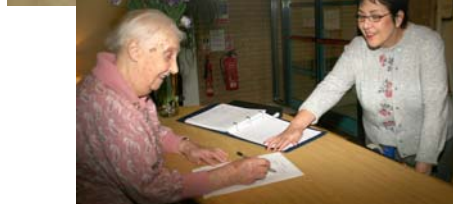
ABOVE: RECEPTION AT THE WALTON COMMUNITY CARE CENTRE Jewish Care Scotland is based in Giffnock, with the social work team, admin staff and volunteer social care agency.