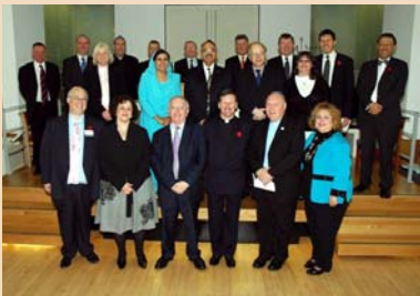
RABBIS, LOCAL CLERGY, POLITICIANS AND POLICE