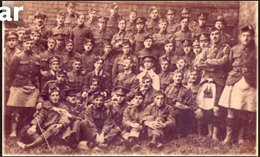
EDINBURGH JEWISH SOLDIERS OUTSIDE THE SYNAGOGUE IN GRAHAM STREET, PESACH 1917