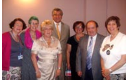
SPEAKERS & ORGANISERS AT THE AJR ANNUAL MEETING IN EDINBURGH

NB No over-large armchair was used in the writing of this monologue.