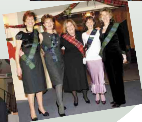
(LEFT TO RIGHT) PIPING IN THE HAGGIS IN LONDON, THE GLASGOW GIRLS, AND "A BRAW NICHT"