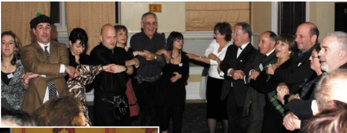
▼ SOME OF THE REVELLERS SING 'AULD LANG SYNE' AT THE END OF THE LONDON EVENT

The feedback has been fantastic: 'splendiferous, nostalgic night', 'rare', 'brilliant', 'fantastic'. The event provided fun and funds, and some 'neebors' were so delighted to be able to meet up that they have already asked to book for next time!