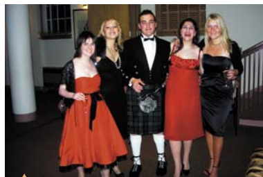
▲ STUDENTS FROM MANCHESTER, MOSCOW, LONDON & BRUSSELS AT THE EDINBURGH J-SOC BURNS BALL