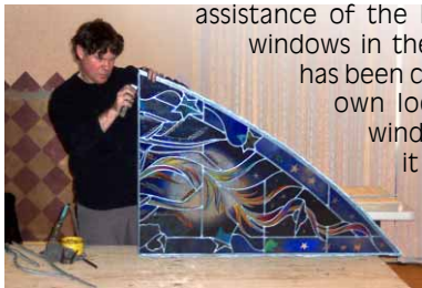
TOP: THE HALF DOME IN ITS ORIGINAL SETTING AT QUEENS PARK SYNAGOGUE

After the sad closure of Queens Park in 2003 their Trustees and the original donors agreed to donate them to Giffnock Synagogue, in order both to keep the sequence together and to retain them within the community. All but the dome have now been installed with the assistance of the Heritage Lottery Fund. The process of installing the windows in their new home has not been simple, and the designer has been closely involved throughout. Some windows found their own location: the narrow rectangles exactly fit the lancet windows in the gallery, and the Shabbat triptych looks as if it was designed to close off the disused choir gallery above the Ark. However the semi-circular windows are now displayed in brackets in the bays of the ground floor, and discussions are still continuing on how best to accommodate the dome.