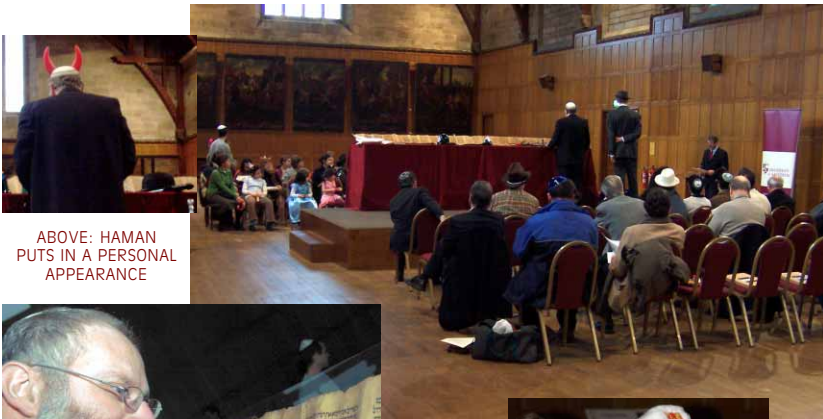
ABOVE: HAMAN PUTS IN A PERSONAL APPEARANCE

If there is ever to be a special Jewish holiday for the Grampians, Highlands and Islands, it will have to be Purim! Not only because there is a long tradition of local Purims, generally to celebrate deliverance from oppression or plague, but because of the several references in the Book of Esther to the "scattered and dispersed" Jews in the 127 provinces of Ahasuerus.