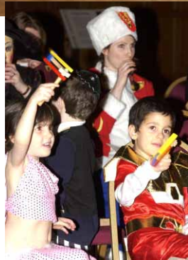
ABOVE: CHILDREN BOOING THE NAME OF HAMAN