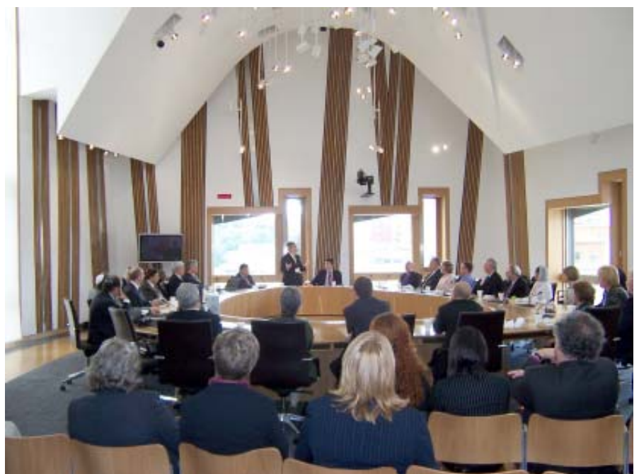
BELOW: CHIEF RABBI ADDRESSING MSPs, FAITH LEADERS, AND INVITED GUESTS IN ONE OF THE PARLIAMENT'S IMPOSING COMMITTEE ROOMS.