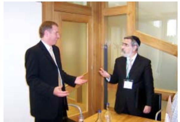
ABOVE: SIR JONATHAN SACKS, THE CHIEF RABBI WITH DEPUTY FIRST MINISTER NICOL STEPHEN.

SCOJeC hosted lunch in the Scottish Parliament for MSPs, faith leaders and invited guests during which the Chief Rabbi responded to questions. He received an extremely warm welcome from everyone, and his speech at Time for Reflection was very well received.